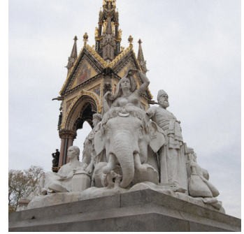
KENSINGTON See the World Differently.