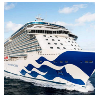
Craig goes on Sky Princess 12/29-1/6/2024