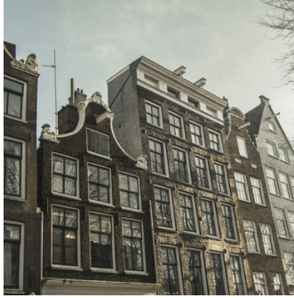
HOLLAND You can Have it All.