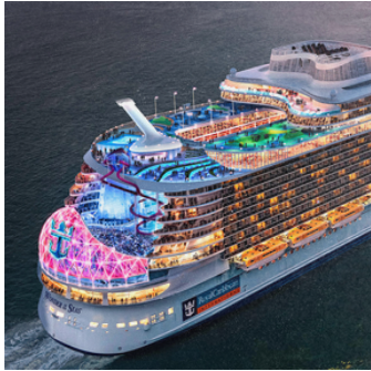
ROYAL Bold beyond Imagination.